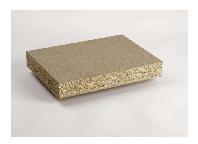
Figure 2: Fimapan/Superpan