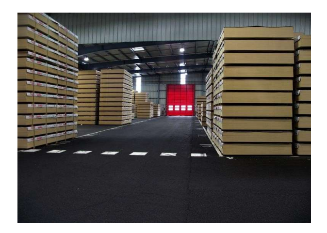
Figure 1: Finished product in Stock