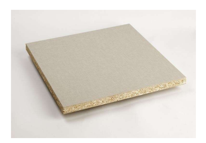
Figure 3: Fimaplast/Superpan Decor